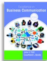
Excellence in Business Communication

14 chapters; paperback Best choice for shorter courses and courses that emphasize fundamental business English skills