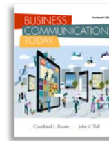
Business Communication Today

16 chapters; paperback Best choice for courses that focus on writing and public speaking, with integrated coverage of technology